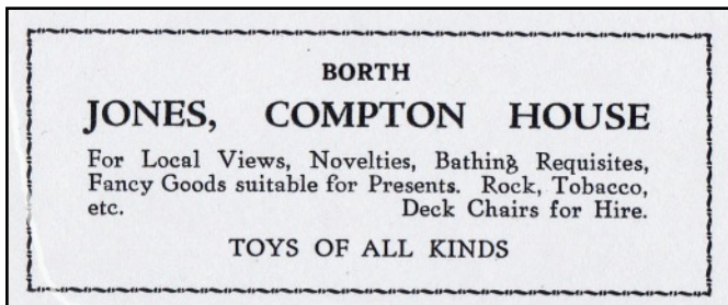
This is from a 'Borth Official Guide' dated 1933