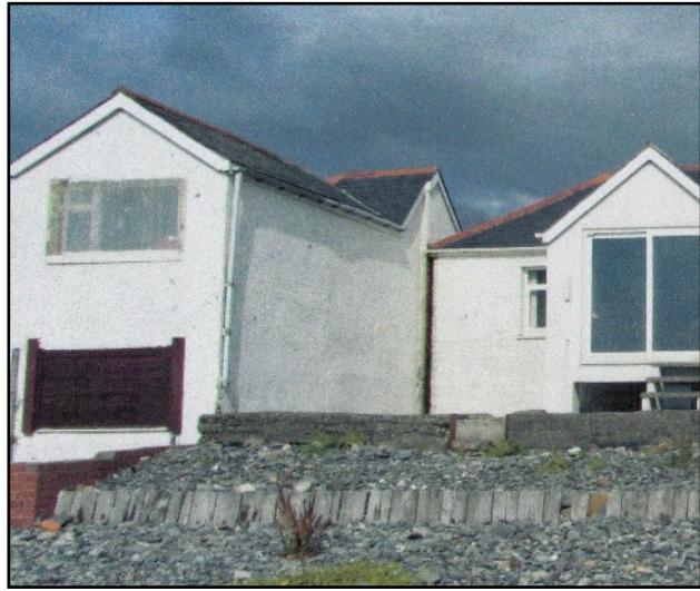
Compton House from the beach in 2015. The south side which adjoins the yard of Sydney House has no windows to overlook its neighbour. Its upper window has fine views out to sea. The lower window is protected from bad storms, The yard ends with a brick wall with an opening with steps down to the beach and it continues behind Cleveland.

The shop and house are built on ground enclosed in 1825 by John Morgan on the stone embankment thrown up by the sea and called 'waste' by the Crown Manor who owned it because it was no good for farming. The road is ancient, having been used in the eleventh century and became a turnpike road in the 1770s. John Morgan built a cottage on his encroachment, but the shop and house stand on the south part of his land, his cottage was further north. For many years no-one built on this land. There was still no building there in 1904.