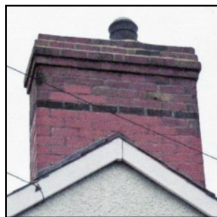
ABOVE The chimney in 2015. There is room for four chimney pots, though now only one.

The rear of the house has a two storey extension under a nearly flat roof on two thirds of the rear. A large picture window in the upper floor gives fine views of the sea. This opens on to a railed balcony with wooden stairs down into the