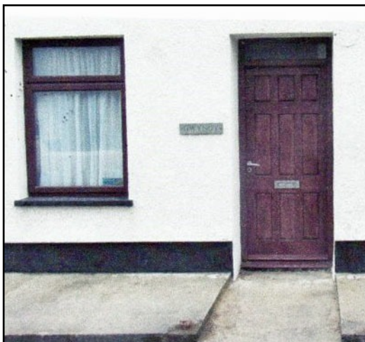
The front of the house in 2015

Gwyndy is a two storey, double fronted house under a gable roof at right angles to the street. It is very close to Anwylfan on the south side, leaving a narrow passage. The brick chimney is at the northern end of the roof, and has decorative strip of dark bricks. There is one chimney pot. The wall on the north side is rubble stone, and a builder working on the front in 2015 said that there are bricks in the front wall. The walls are rendered, and the front of the house is plain. The windows are all modern. The house opens on to the street with a pavement area of hard standing. The width of the front fills its plot - there is no access to the rear.