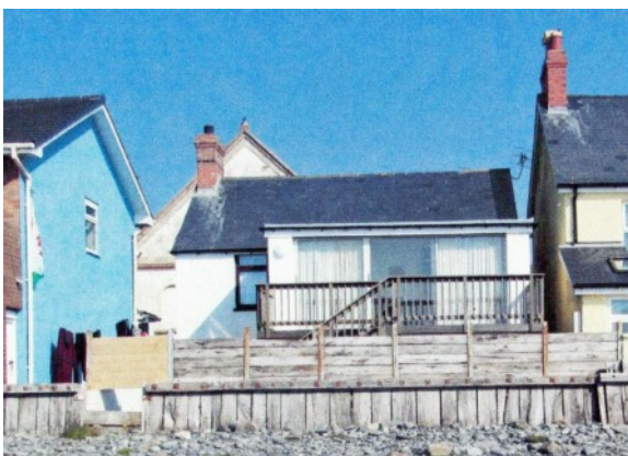
The rear of the house from the beach in 2015.

So far we do not have a photograph of this house on old postcards. The name of the house is Welsh, gwyn being 'white' and dy (ty) being 'house'. Today it is indeed a 'white house' with its white rendering.