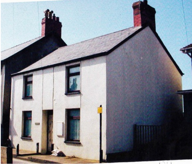
Gwyndy in 2009

Formerly part of Wesleyan Place, called after the chapel across the High Street. It began as a cottage at the southern end of Morfa Borth, which was built by 1829 on ground enclosed in 1827. By 1910 it was a two storey house called Teifi.