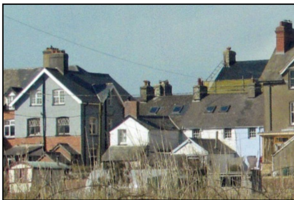
LEFT At the back is a single storey extension. substantial extension, and some outbuildings. There is a long narrow garden which extends down to a ditch - the former brook. Roof lights are for an attic floor and the windows have the pattern of the sash windows in the front of the house.

This is the middle house in a terrace of three houses. It is a bare two storeys high, and single fronted with a front door on the north side. It has walls of rubble stone which are rendered, and a gable roof parallel to the street, which has a rubble stone chimney shared with neighbours either side of its roof. All the front windows are sash windows which match the other houses in the terrace. They have narrow glazing bars and may be original or modern copies. There is a small curving wall in the front of the house enclosing a very narrow strip of ground.