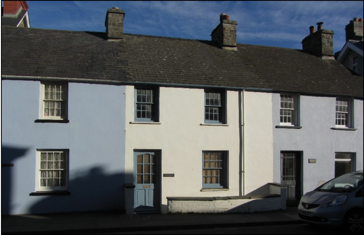
ABOVE Morfan in 2019 is the centre house of this terrace of three.

Formerly part of New Street and on the east side of the High Street. Built for a home by a Rees family of master mariners and used for holiday visitors. Being built at the 1861 Census and still owned by members of the family in the twentieth century but let to tenants.